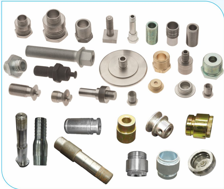
CNC Turned Components