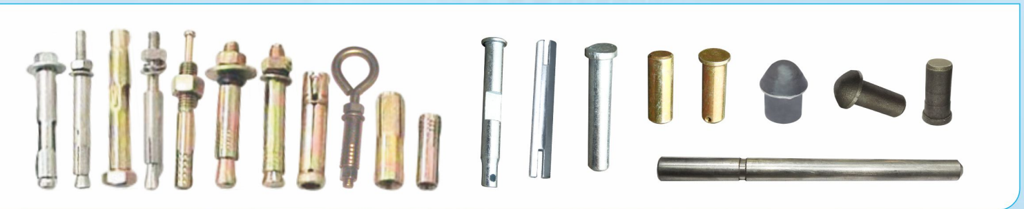
Anchor Bolts / Rivets & Pins