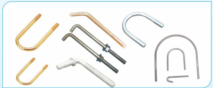
U Bolts, Foundation Bolts, L Bolts & J Hooks