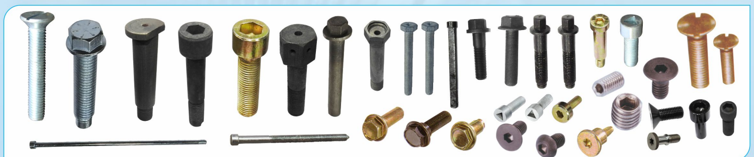
Allen Bolts & Screws / CSK Screws / Flange Bolts