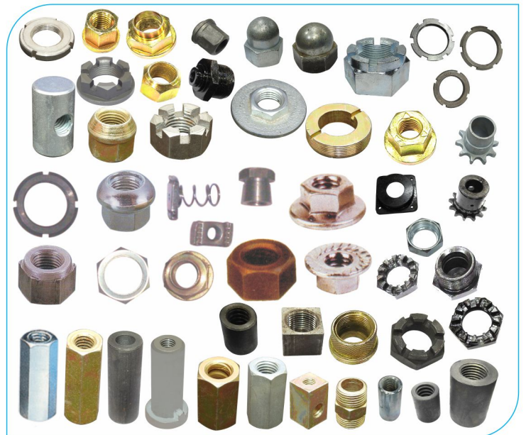
Special Purpose Nuts, Round Nuts & Long Nuts