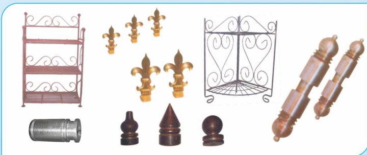
Fancy Hinges & Fancy Stands