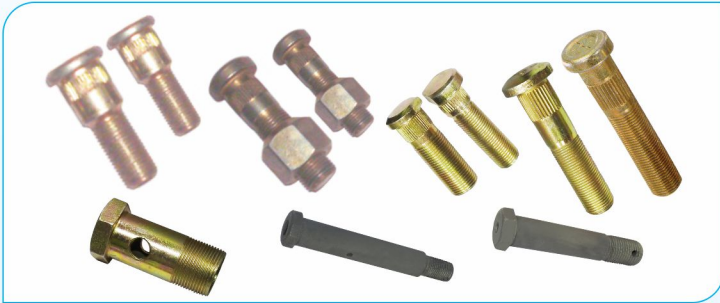
Hub Bolts / Center Bolts / Shackle Bolts

Continuous Improvement & Customer's Satisfaction is Our Motto