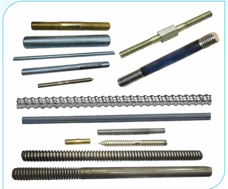
Thread Bar & Studs