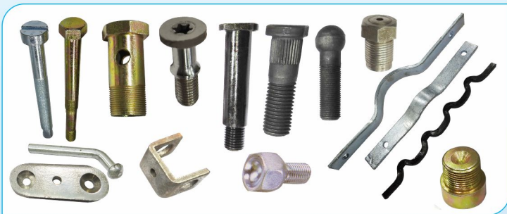
Round Head Bolts & Special Head Bolts / Press Components