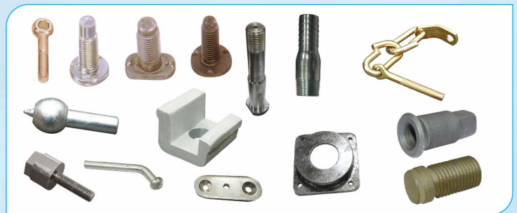
Miscellaneous Products / Customised Items