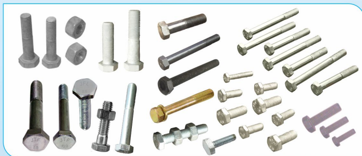
High-Tensile Bolts & Screws