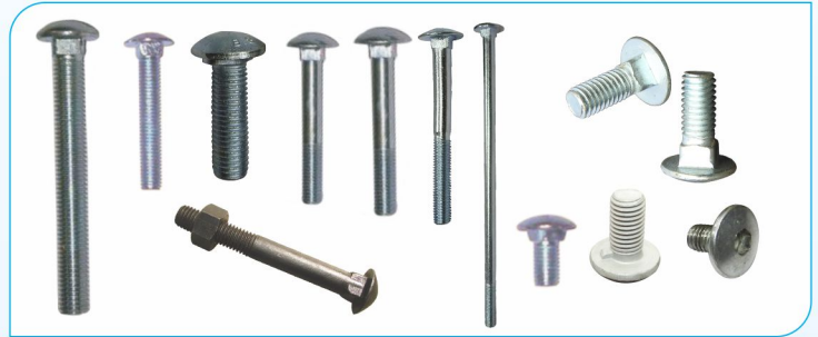
Carriage Bolts ( Round Head with Sq. Neck or Oval Neck )