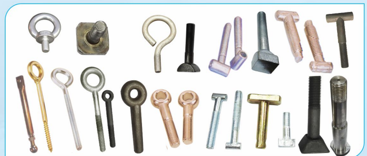
Eye Bolts / T Bolts / Hammer Head Bolts / Square Head Bolts