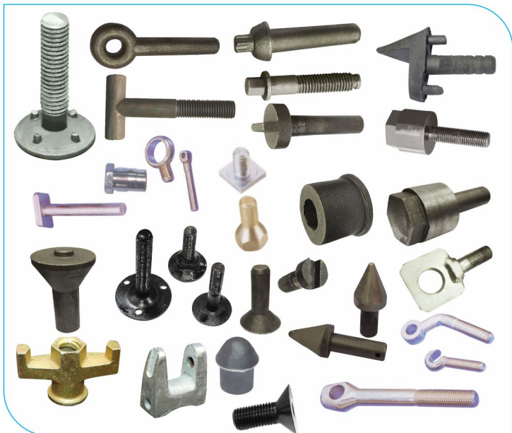
Metal Gathering Items / Special Forged Components